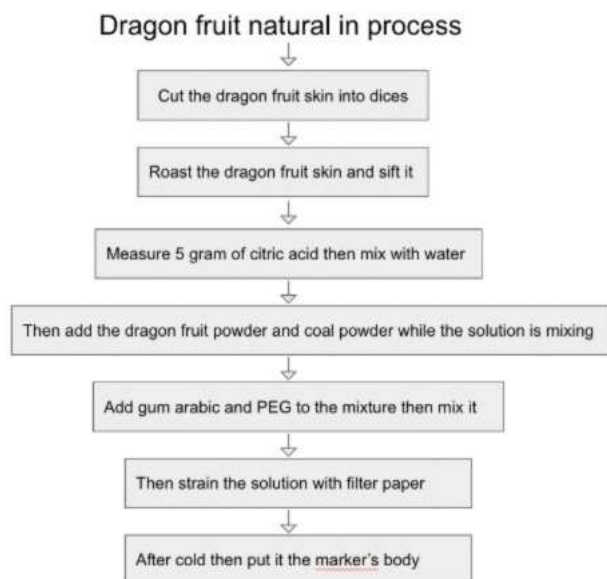
Image 1. Procedure Dragon Fruit Natural in Process

The diagram illustrates a flowchart of the production process of natural ink from dragon fruit peel. The steps are as follows: